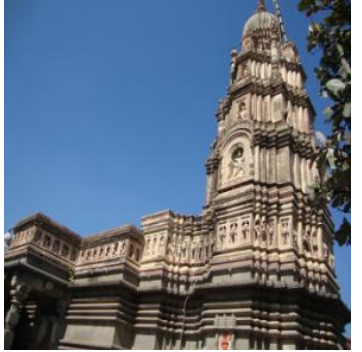
Fig. . Cover Image(2) (Mandir) for second experiment

The above said algorithm is also verified using the following cover images and secret images. The cover image is Mandir image and secret images are shown [4]. below.