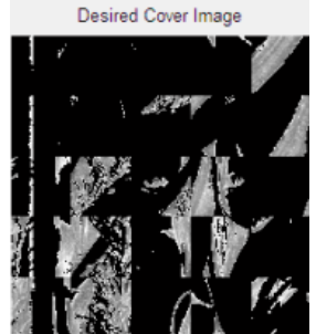
Fig. 4.8 Cover image bit mask

Cover image bit mask is generated as shown in Fig. 4.8 Secret image is converted into bit streams. Here all the bytes in the secret image (data) are converted in the binary.