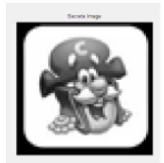
Fig. 4.3 Secret image - Original