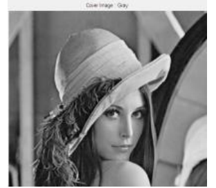
Fig. 4.2 Cover image – Gray scale