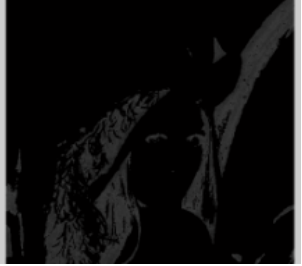
Fig. For T=60

Cover Image Embedding size = 39601 Bytes