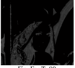
Fig. For T=80