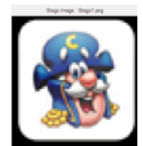
Fig. 4.4 Secret image – Gray scale

Consider the threshold value equal to 80 then region selection is as shown in Fig 4.5