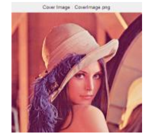
Fig. 4.1 Cover image(1)

Cover image is selected and converted to gray scale image. Converted image shown in Fig. 4.2. Secret image is selected and preprocessed it. Secret image is as shown in Fig. 4.3. and 4.4.