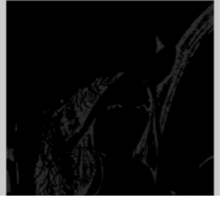
Fig. For T=50

Cover Image Embedding size = 39601 Bytes