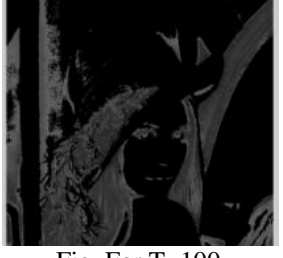
Fig. For T=100