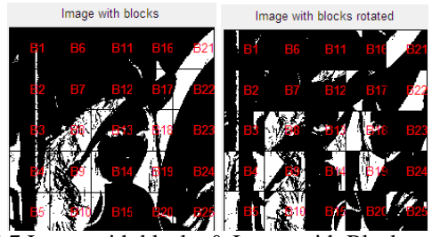
Fig. 4.7 Image with blocks & Image with Blocks rotated with angle 180^{\circ}

Cover image is converted into non overlapping blocks and is as shown in Fig. 4.7 The blocks are rotated 180^{\circ} and as shown in Fig. 4.7 The cover image is arranged as row vector 'V'. This vector is divided into non-overlapping embedding units as shown in Fig. 4.8.